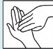
The tips of the fingers