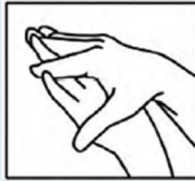
The back of the hands